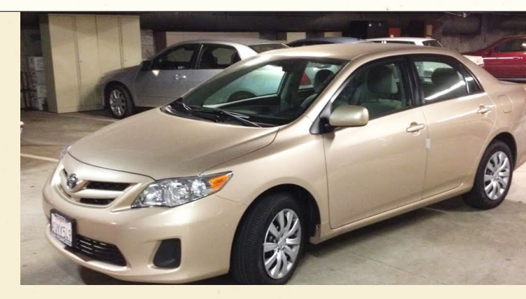
Did You Know? Car donations like this 2012 Corolla, auctioned in January, raise between $15,000 and $30,000 per year for SSNC programs, projects, and charitable funds.

Donating your car can be a significant and meaningful decision. We work with you to make the process easy, every step of the way. We'll handle the DMV paperwork, arrange appointments with potential buyers, and provide you with all the documents for your tax returns—all at no cost to you. We'll even jump start your car, if necessary. All you need to do is provide your keys and title, and make sure your car is in good running condition.