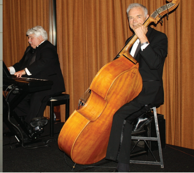
Music by The Dale Alstrom Quartet