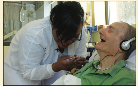
Still from the film "Alive Inside: The Story of Music and Memory."