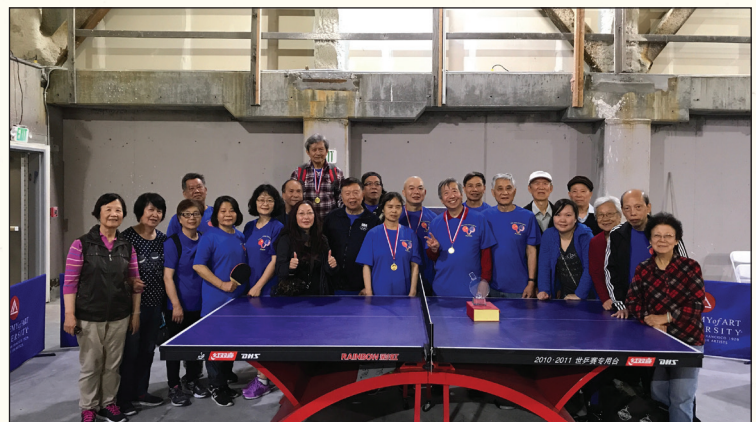
Members of the EPA-WPA ping-pong team