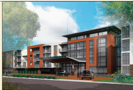
Viamonte

Congratulations to everyone on the Viamonte team!